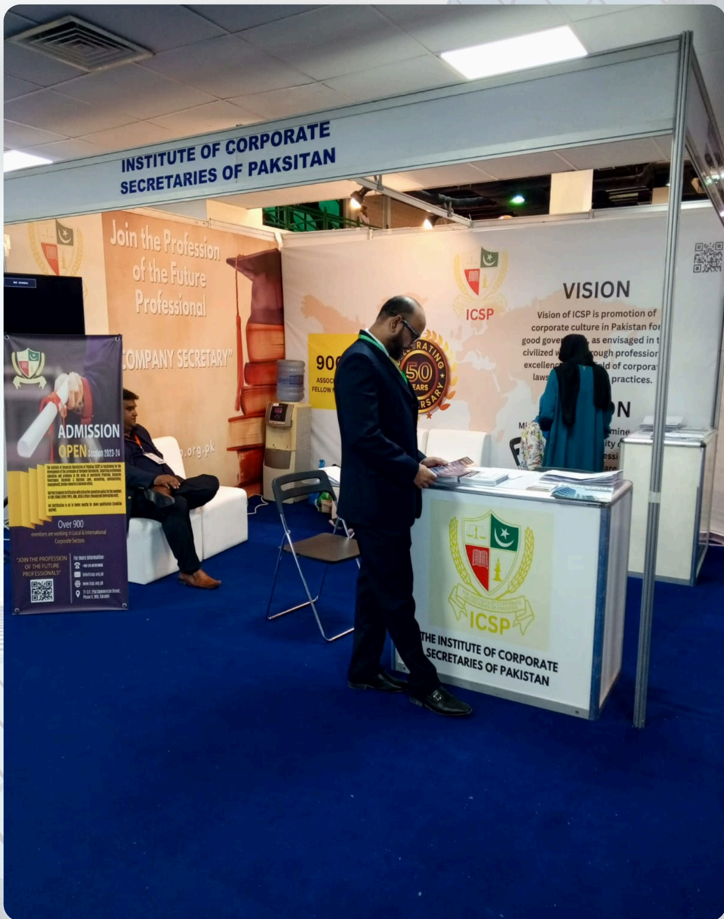
Our Stall Outlook