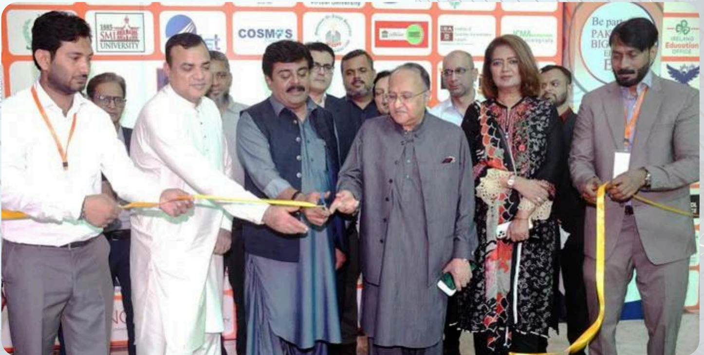
Mr. Sardar Ali Shah - Education Minister Sindh Inaugurated the Education Expo-2024